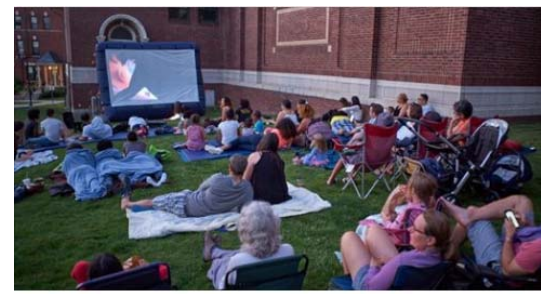
AUG 7 Summer Series - Movie Night Public - Hosted by Hyde Square Task Force and Boston's Latin Quarter