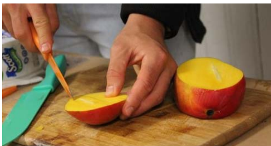
JUL 24 Summer Series - Neighborhood Table Public - Hosted by Hyde Square Task Force and Boston's Latin Quarter

Located in Jamaica Plain's Hyde/Jackson Square, the Latin Quarter is a dynamic cultural district where Latino immigrants, primarily from the Caribbean, have thrived for decades. The area has more than 125 businesses, 65% of which are immigrant owned. In Boston's Latin Quarter one will find crowded Dominican barbershops, Latina beauty salons, bright murals, sculptures, Latin American travel agencies, cuisine from various cultures, and corner bodegas, all while cars cruise by blasting the latest bachata song. El Oriental de Cuba, a destination restaurant, and El Mundo Boston, Boston's leading Spanish-language newspaper, are located in the district.