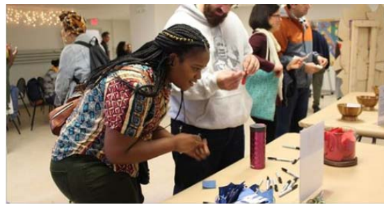
JUL 31 Summer Series - Feel the Rhythm Public - Hosted by Hyde Square Task Force and 2 others